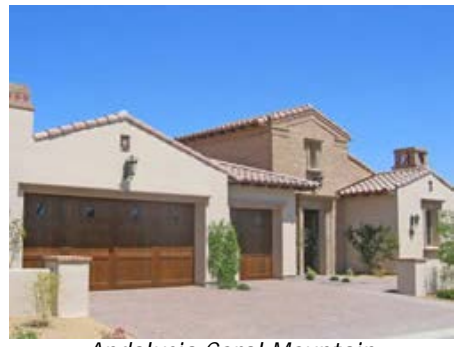
Andalusia Coral Mountain in La Quinta - 20/30 Finish

Whichever type of project you are working on, <u>specify</u> <u>Merlex</u> to make an impression that lasts.