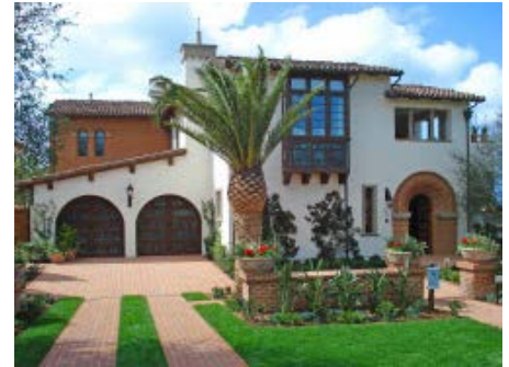
The Tides in Crystal Cove Santa Barbara smooth finish

Merlex also observes texture trends, giving their customers the option to go with the coolest new look, or to stick with the classics.