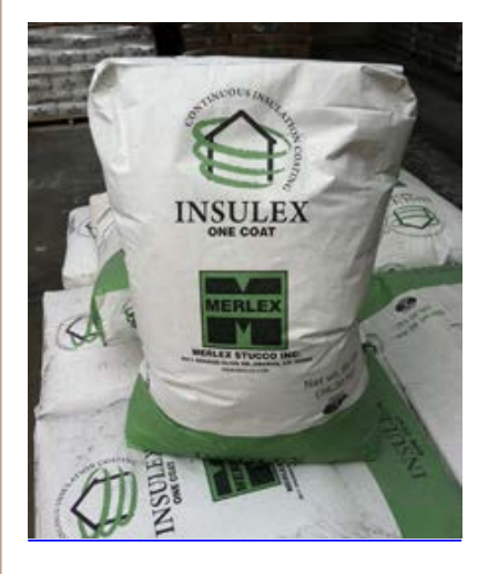
A continuous insulation one coat stucco system for <u>superior energy</u> <u>efficiency</u>.